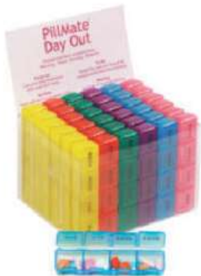
PILLMATE 19026 DAY OUT CODE: ME600A PACK SIZE: 36