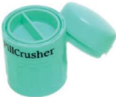
PILLMATE 19040 PILL CRUSHER CODE: ME600C PACK SIZE: 4