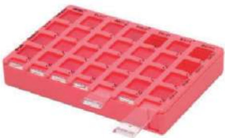
PILLMATE 19025 MULTIDOSE CODE: ME599D PACK SIZE: 4