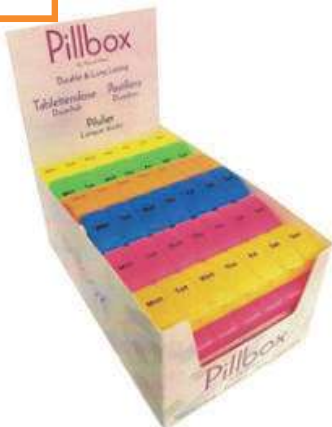
PILLMATE 19050D 7 DAY CODE: ME600E PACK SIZE: 24