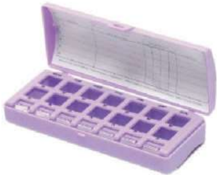
PILLMATE 19024 TWICE DAILY CODE: ME599C PACK SIZE: 4