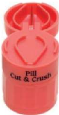
PILLMATE 19039 PILL CUT AND CRUSH CODE: ME600D PACK SIZE: 4